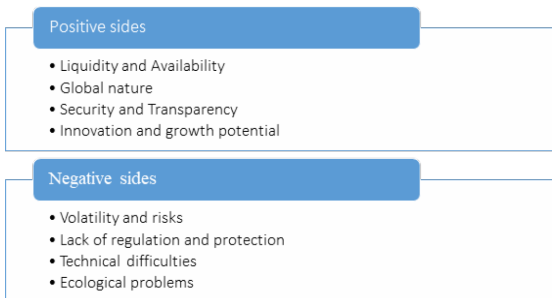
Fig. 3. Advantages and disadvantages of digital assets 3 .

The widespread use of digital assets such as cryptocurrencies, tokens, and other forms of digital value has its pros and cons. Consider them in more detail (fig. 3).